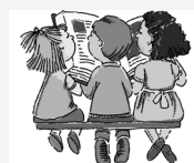
Sharing God's Word

The After School Club's Staff is set for eight Wednesdays beginning January 12 and ending March 2 from 2:00-5:30 pm. A free meal for kids and families is at 5:15 pm.